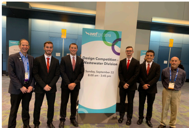
WINNING STUDENT DESIGN TEAM